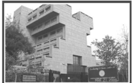
Indian National Science Academy at New Delhi

The Company, through its Official Language Implementation Committee is constantly endeavoring to enhance awareness of employees regarding "Progressive Use of Hindi" in the Company's day-to-day workings and to fulfill various other requirements as per Ministry's Annual Programme and other Government Directives received from time-to-time. Meetings of Hindi Implementation Committee are held once in each quarter to review and monitor the progress achieved in this regard. Regular Hindi Classes are conducted in the premises of the Company for imparting Hindi training to the non-Hindi knowing employees. So far 322, 292 and 260 employees had passed the Hindi 'Prabodh', 'Praveen' and 'Pragya' Examinations respectively. 'Cash Awards' and 'Personal Pay' are granted to the employees, for passing the Hindi Examination as per Government norms.