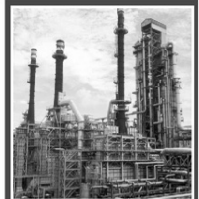
Heater work at HPCL, Vizag

Value of work done in Project activities during the year is Rs. 900.53 crores as compared to Rs. 678.68 crores last year. Important projects which are successfully completed during the year include -