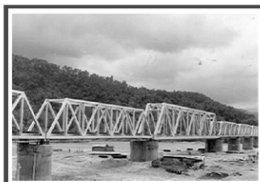
Bridge Regirdering over River Diana for N.F.Railway