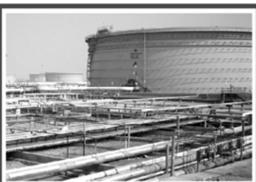
Oil Storage Tank at Reliance, Jamnagar

The Company got its first ever order on "Depository type of work " from IIT, Kharagpur for Construction of Buildings, Hostels etc.