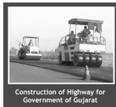
Construction of Highway for Government of Gujarat